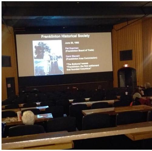
The Society's Annual Meeting was held at the historic Grandview Theater & Drafthouse.